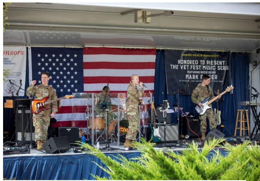
287 TH ARMY ROCK BAND