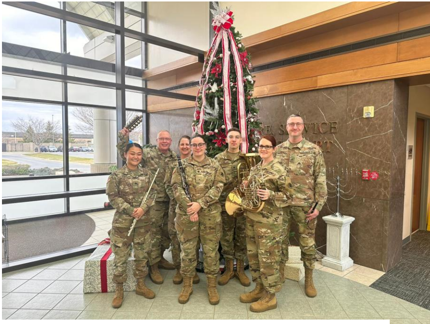
287 TH ARMY CHAMBER ENSEMBLE